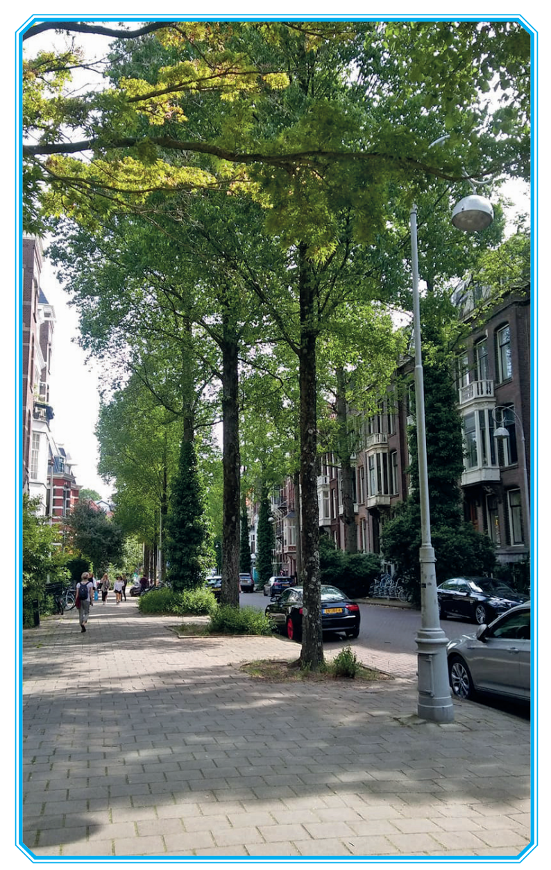
Picture 3: Group planting of trees – an example from Amsterdam (The Netherlands)