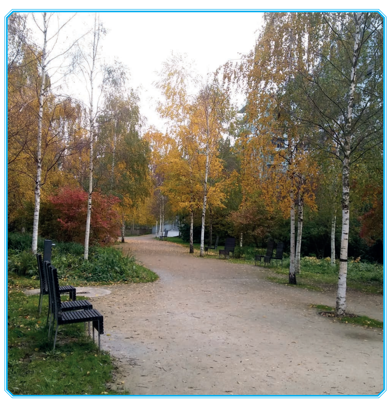
Picture 13: An example of the use of a permeable threshing surface in park greenery – an example from eco-district Boulogne Billancourt in France