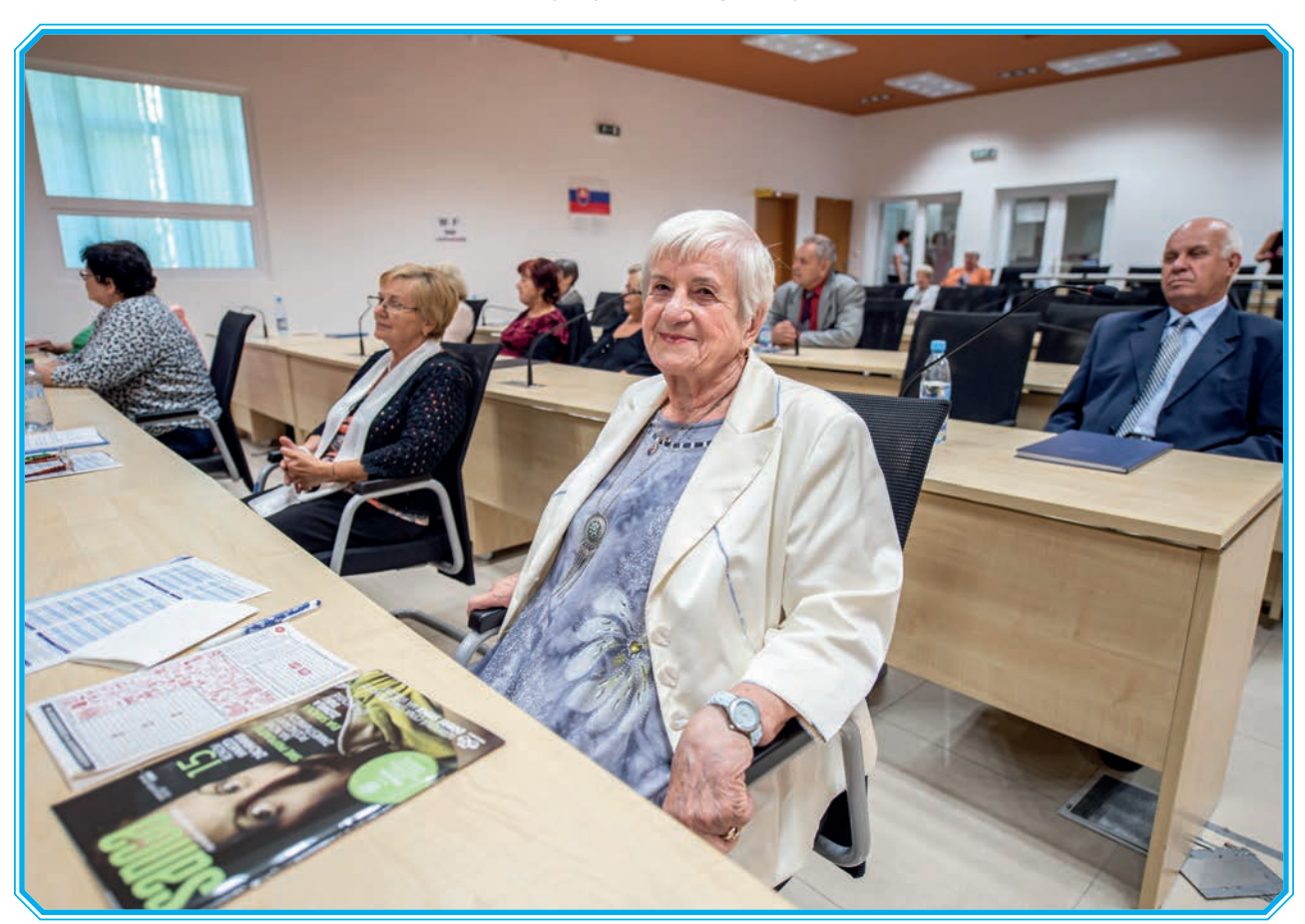
Picture 27: Seniors spending free time in the air-conditioned meeting room of the Bratislava Self-Governing Region authority during the heat