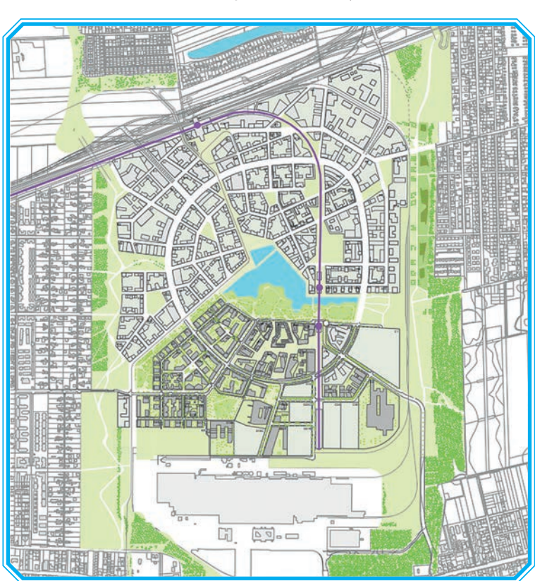
Picture 1: Aspern Seestadt – a new part of Vienna with elements of climate-conscious spatial planning and a smart city

Measures to increase the resilience and adaptability of the city's territory to adverse impacts of climate change include, for example, maintaining corridors for ventilation and wind circulation in the city, creating a network of biocorridors, ensuring sufficient functional green spaces and their accessibility for the population, appropriate regulatory framework of the territory (e. g. coefficient of vegetation areas, surface impermeability ratio, ecoindex) and others.