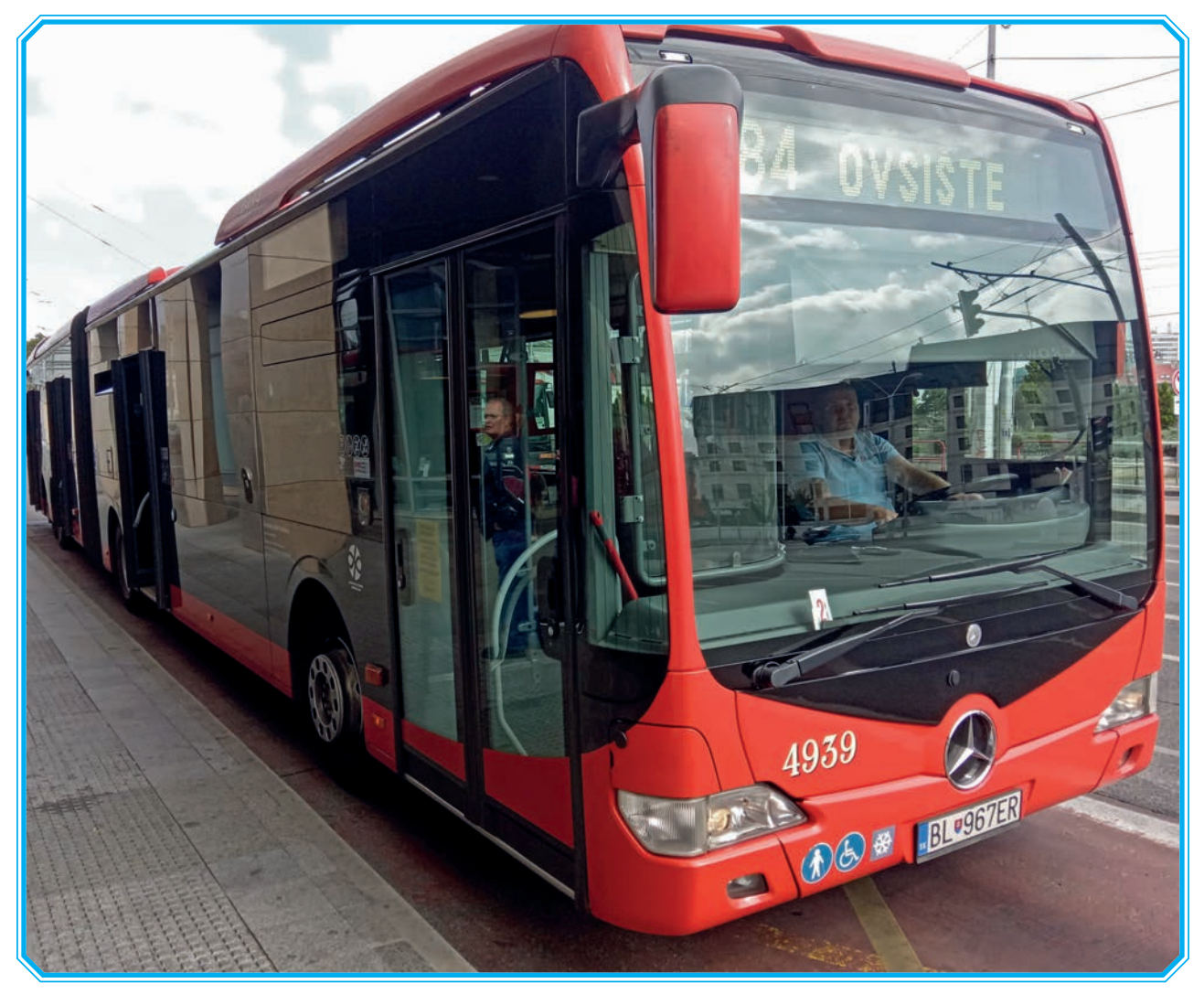
Picture 25: Air-conditioned vehicles of public transport with reflective coating on windows in Bratislava, Slovakia