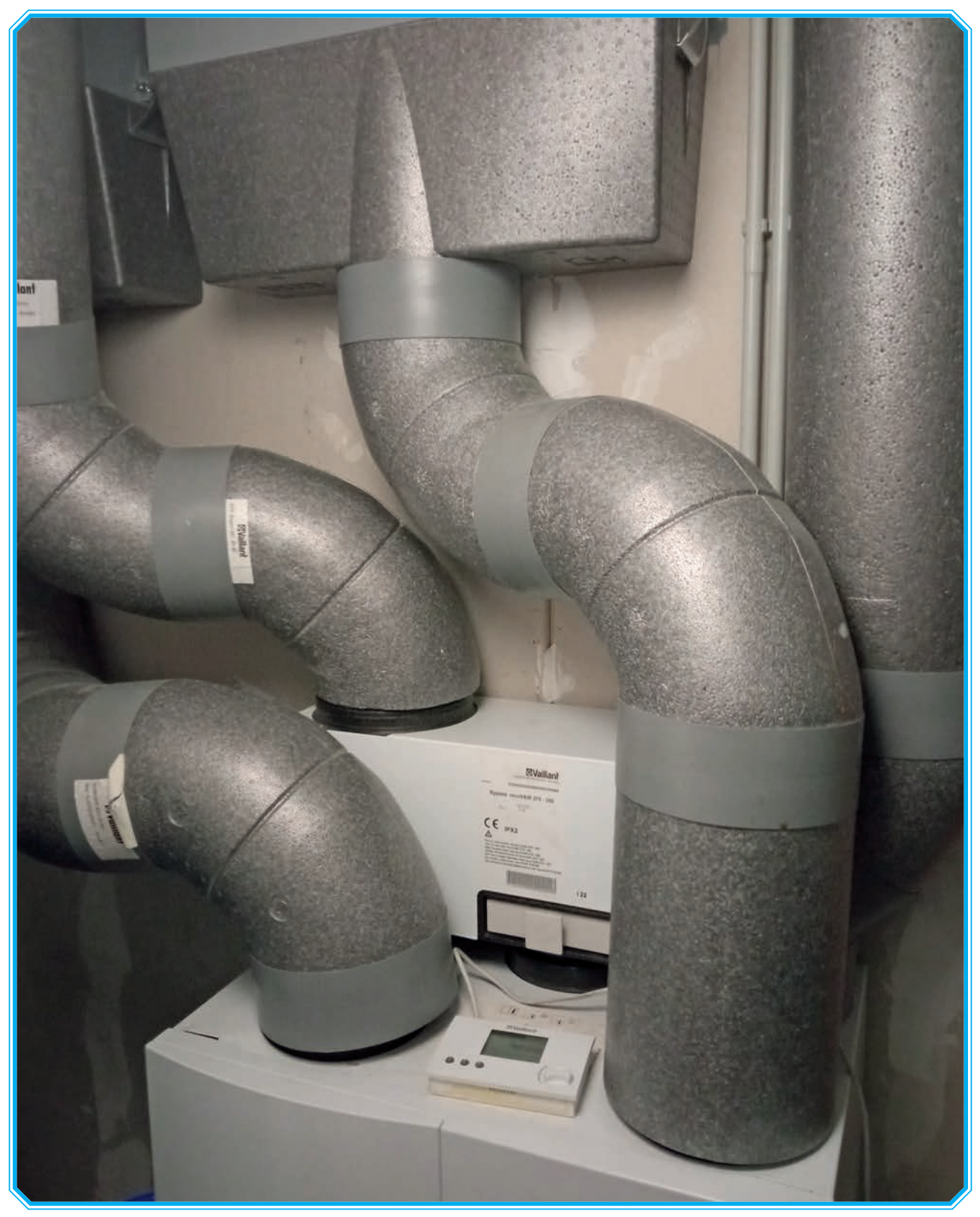
Picture 20: Installation of ventilation control module with heat recovery and bypass