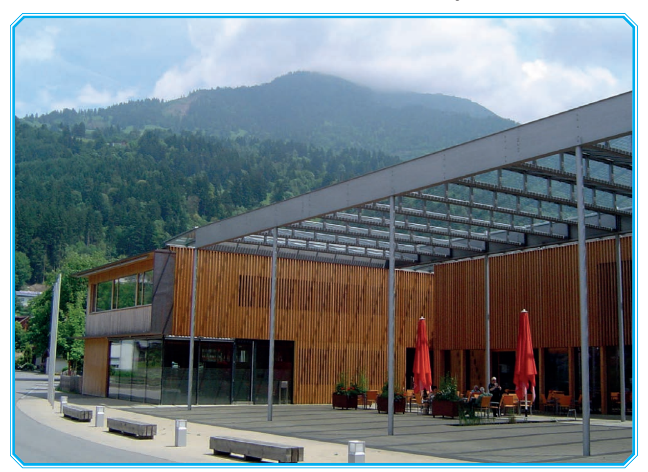
Picture 16: Ludesch Community Centre (Austria) in a passive energy standard and with a facade made of wood obtained from the surrounding forests

When choosing construction materials, it is important to take into account their impact in terms of mitigation and adaptation. For both new and renovated buildings, from 1 January 2021, it is required in the Slovak Republic to achieve the standard of buildings with almost zero energy demand, which is based on the European directive on energy performance of buildings which has been reflected in several regulations and standards in Slovakia. When designing structures and buildings, it is necessary to respect the current (2020) thermal-technical standard e. g. in Slovakia STN 73 0540, which defines the criteria of minimum thermal insulation properties of the building structure (values of the heat transfer coefficient of the structure – U), i. e. external walls of buildings, roofs, floors above unheated space. A building structure can therefore consist of a single-layer or multi-layer structure, if it meets the requirements defined by the standard and the relevant regulations for achieving the energy class of the building during certification. Various types of building materials have different accumulation capacity and thermal phase transition.